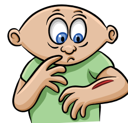
Infections or injuries heal more slowly than usual

For more information, visit Cornerstones4Care.com